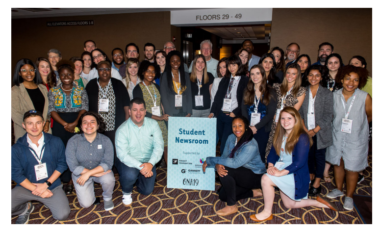
The 2019 Student Newsroom members and their mentors during the first day of the ONA19 conference.

Stories they produced covered topics such as navigating parenthood and a journalism career, climate reporting and the industry's union movements. Students also gained sourcing